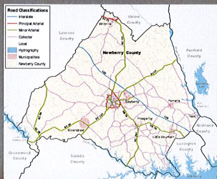
SC DOT Functional Road Classifications